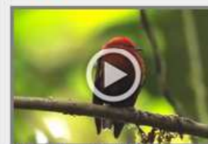
Bird's wing is built for love, not flight Cornell University