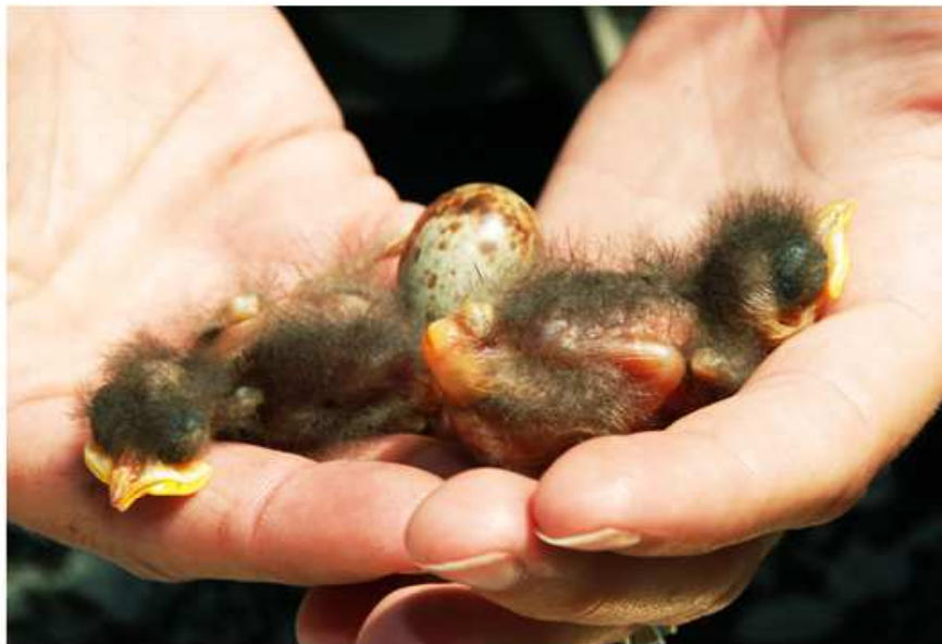
In the last 20 years, the "Sylvester & Tweety" issue has become increasingly controversial, with birders and cat lovers taking a stand. The American Bird Conservancy reports cats kill hundreds of thousands of birds in the U.S. every year, including mockingbirds, which have adapted well to urban life.

U. FLORIDA (US) — Cats are the dominant predator to mockingbird eggs and nestlings in urban areas, prompting conservationists to urge pet owners to keep felines indoors at night.